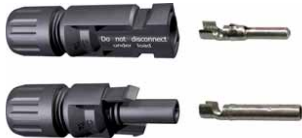
The MC4 plugs and sockets, shown with associated contacts.