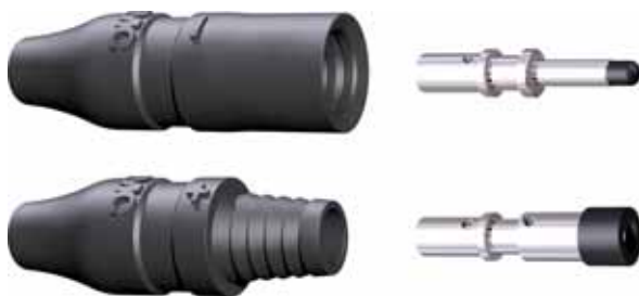
The MC3 plugs and sockets, shown with associated contacts.